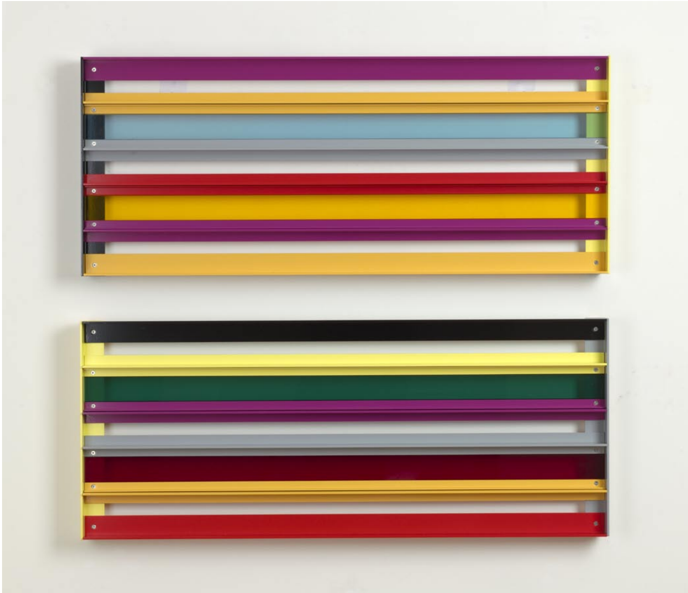
Related Faction sculpture by Liam Gillick