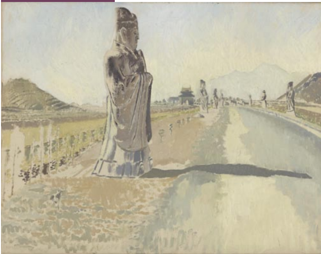
The Minister, Ming Tombs, Peking by Stanley Spencer