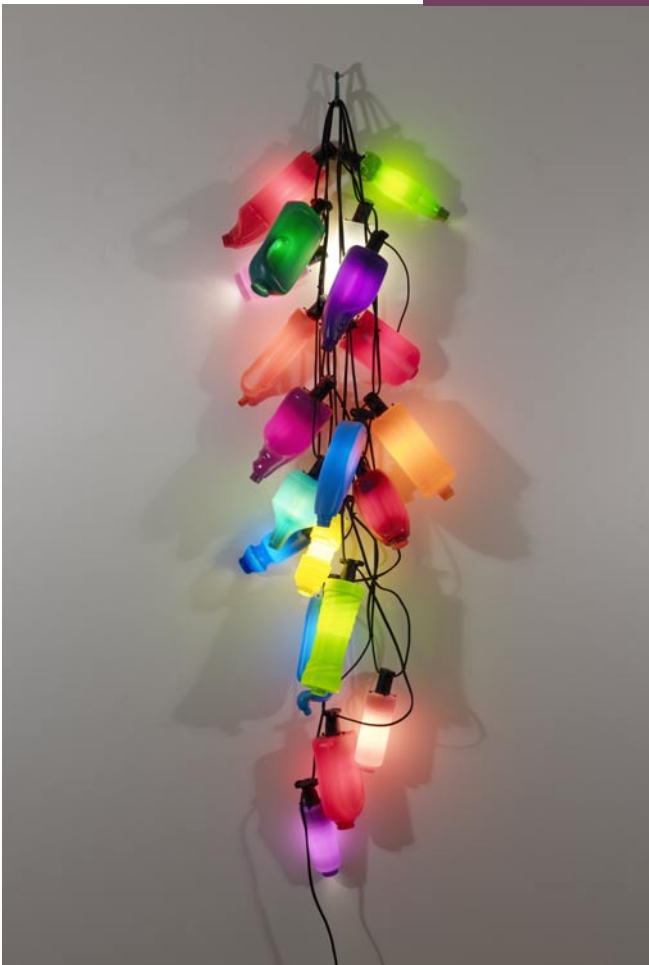
Waldella VI by David Batchelor