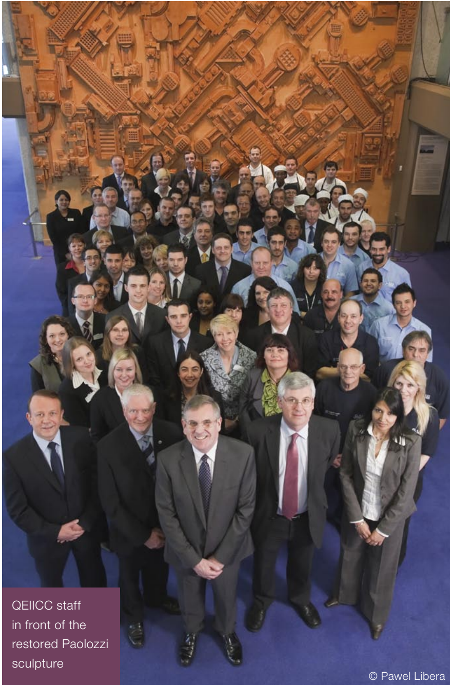
QEIICC staff in front of the restored Paolozzi sculpture