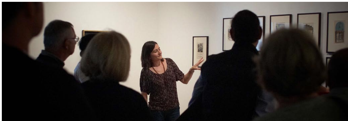
Visitors enjoying an Open House Tour at the GAC's premises