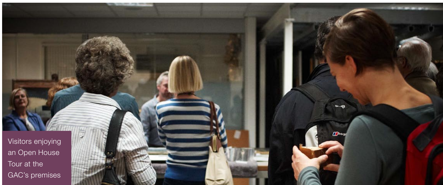
Visitors enjoying an Open House Tour at the GAC's premises

Looking back over the past year, what stands out is the extraordinary growth in public interest in the Government Art Collection (GAC). We've been featured on radio and in the newspapers. And the public continues to flock through the doors of our headquarters when we have open house days.