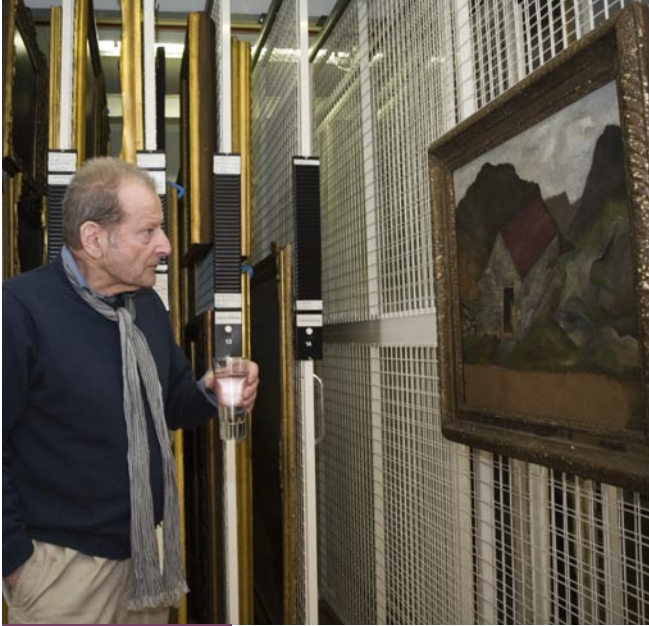
Lucien Freud viewing his work Welsh Landscape

We installed Lucien Freud's painting Welsh Landscape c.1939–40 in a prominent location in 10 Downing Street after it came back from New York. Earlier in the year we had been delighted to welcome Lucien Freud to the GAC to see his painting, an early work that he had not seen for many years. Watching Freud reconnect with his work by placing his hands on the surface of the painting was a moving experience and one of the undoubted highlights of the year.