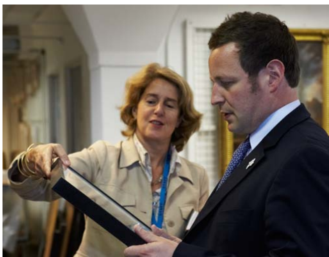
Minister for Culture Ed Vaizey during his visit to the GAC.

As Jeremy Hunt states above, Britain has a wealth of artistic talent and the Government Art Collection's role is to support and promote this through its regular changing displays. As the Secretary of State also recognises, these new displays are much scrutinised. This year, the press – as always – were quick to pick up on the fact that the art a minister chooses for their office might reveal something about their personality. Headlines like The Prime Minister's has a speeding theme ... but what about the rest of the Cabinet's? ( The Independent 31 July 2010) were rife in the months following the election and whether the art chosen reflected an historical or contemporary bias was a subject of much speculation. Interestingly, when the GAC conducted its own research, the range of works chosen by new ministers revealed that approximately 50% of the displays were of modern/contemporary art, 25% of historical and 25% a mix of both.