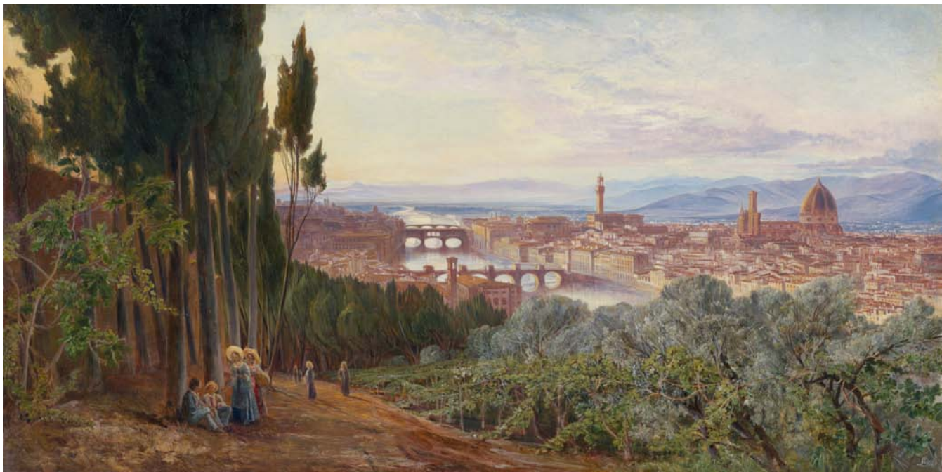
View of Florence from Villa San Firenze by Edward Lear