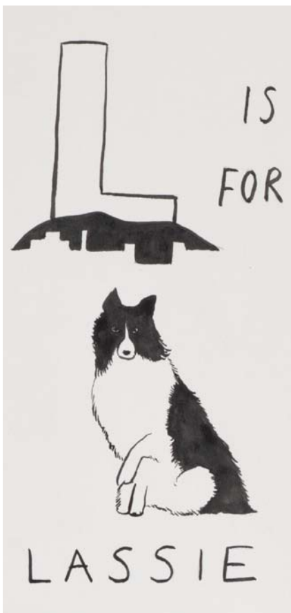
An Alphabet of LA by Donald Urquhart (detail)

candy floss pink sculpture The Doors (LA Woman) (2005), has cultural references not only to the Californian band The Doors and their most critically acclaimed album, but also to Aldous Huxley's 1954 book Doors of Perception (after whom the band was named) and to the 18th century poet William Blake, from whom the line 'doors of perception' originated.