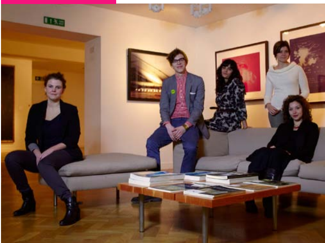
The first cohort of London Metropolitan University students

able to share some of this experience with students from LMU's MA course Curating the Contemporary. The students came to the GAC's premises in autumn 2010 and worked alongside the GAC team for six months. The end result was a series of temporary displays that the students created using works from the Collection at our premises and which were open to the public at set times. For the second year running we also held a Curators' Day, in partnership with the Arts Council Collection, using the GAC recent website development project as a starting point. Topics included issues around the future of collections-based websites and the challenges of virtual audiences and developments in technology.