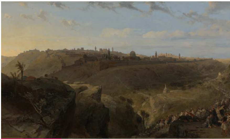
View of Jerusalem from the Mount of Olives by David Roberts