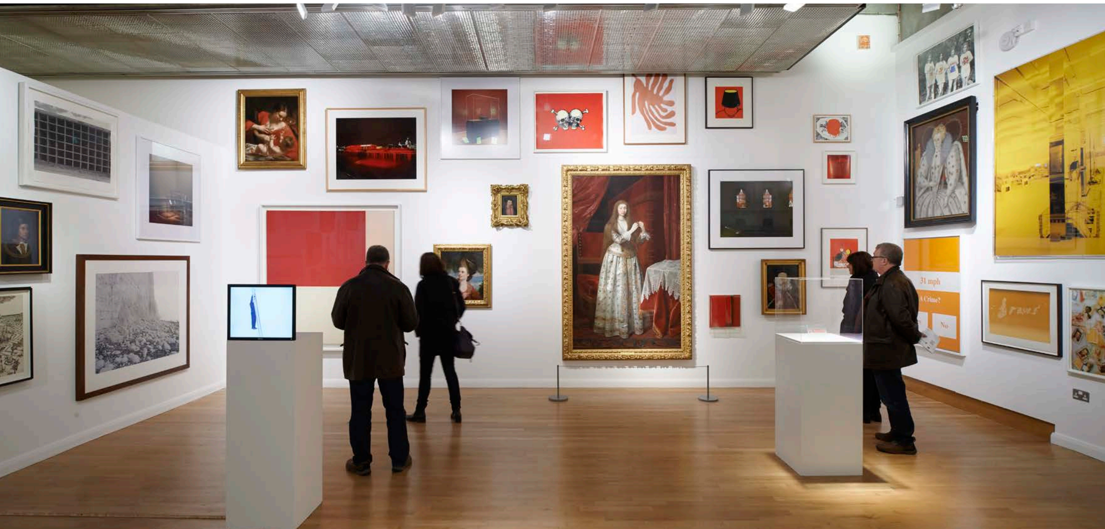
A view of the Revealed exhibition on the opening day at Ulster Museum, Belfast.