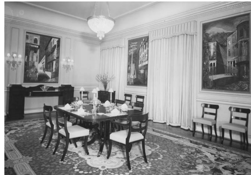
Below: The Pipers displayed in the Ambassador's Residence in Rio de Janeiro in the 1950s.