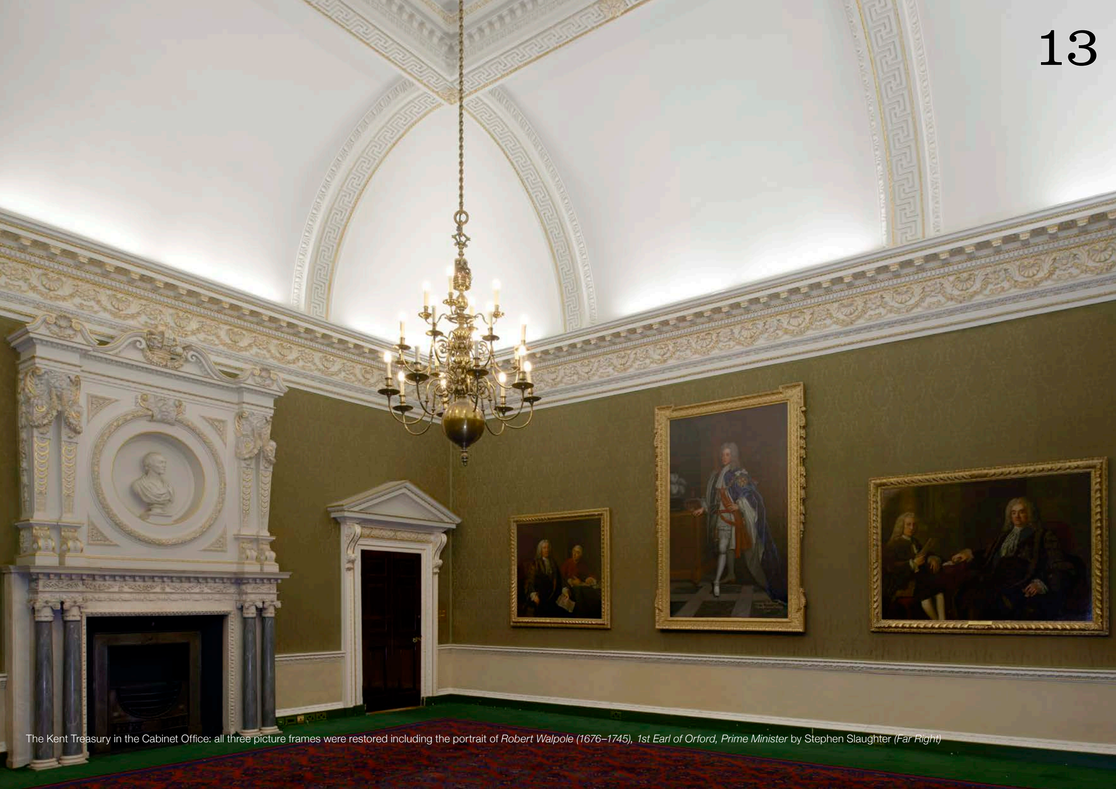
The Kent Treasury in the Cabinet Office: all three picture frames were restored including the portrait of Robert Walpole (1676–1745), 1st Earl of Orford, Prime Minister by Stephen Slaughter (Far Right)