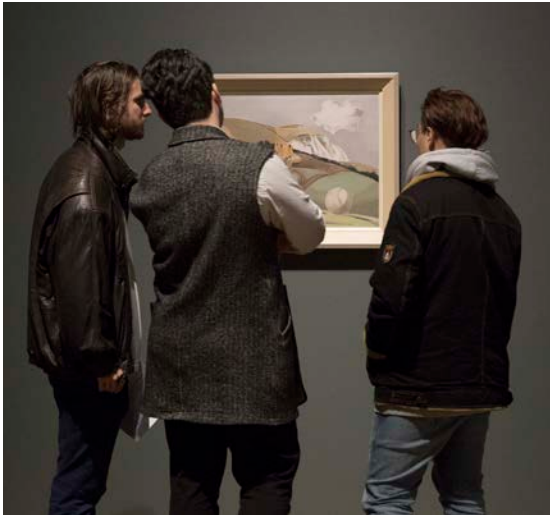
Event on the Downs by Paul Nash, shown in the National Gallery's exhibition 'Still Life' curated by Tacita Dean