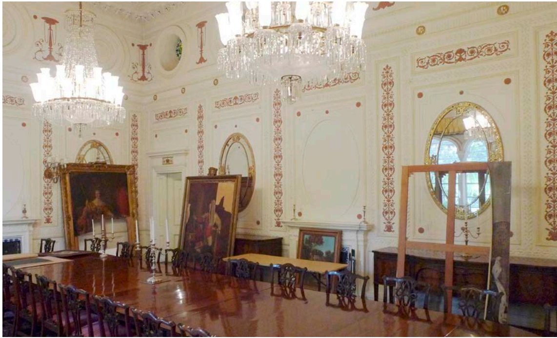
Far right: metamorphosen I , by Edmund de Waal on display in the British Embassy, Vienna