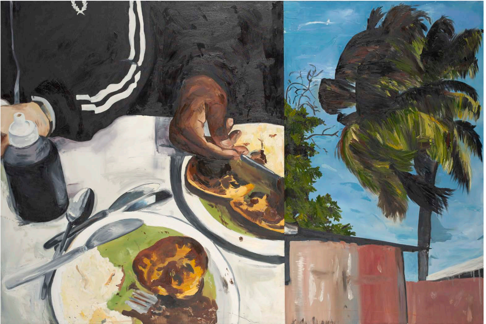
New Acquisition: Michaela Yearwood-Dan's painting Two, Twos © Michaela Yearwood-Dan