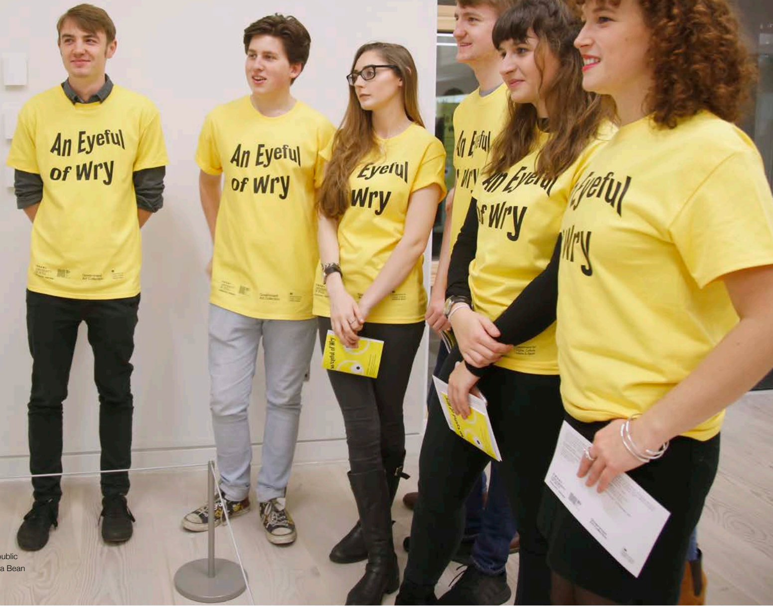
Some of the 16 first and second year Hull University student volunteers who were trained as public invigilators for the duration of the exhibition An Eyeful of Wry