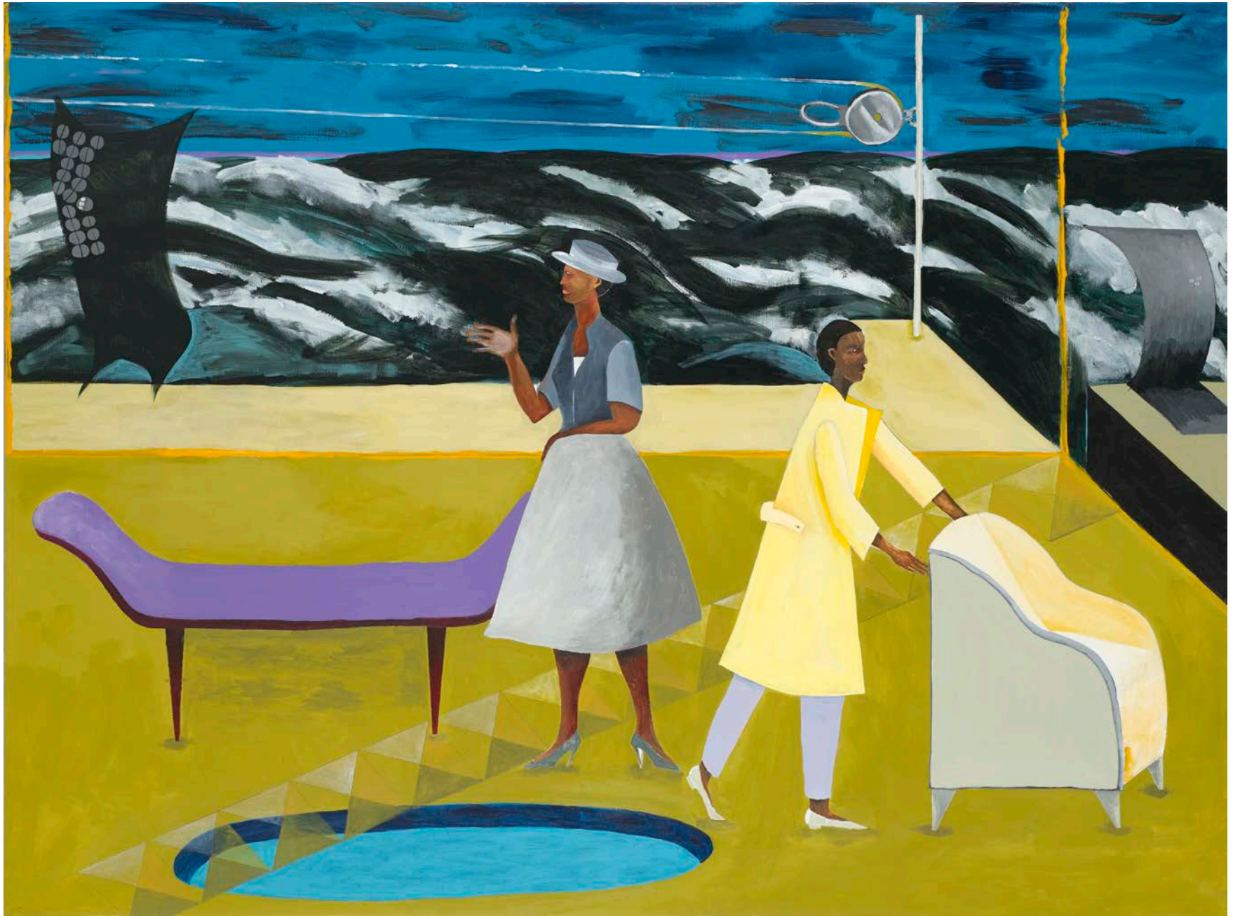
New Acquisition: Lubaina Himid's 2016 painting, Le Rodeur: The Pulley © Lubaina Himid